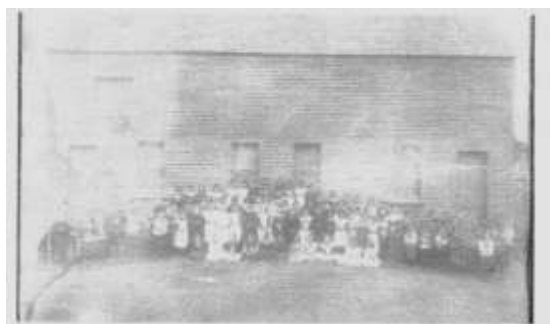
Early St. John's School