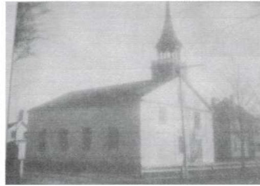
Church on corner of Federal and Franklin Streets