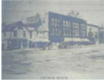
The Church Block of Snow Block which replaced the Maine Street Church