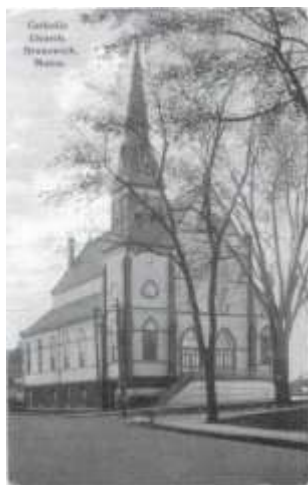
Larger Church in 1882