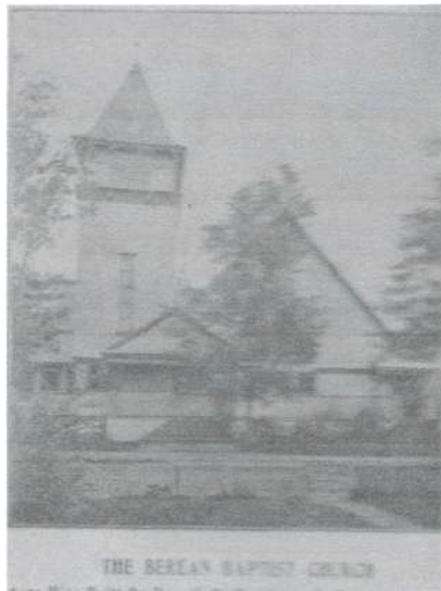
Church in 1904

It was customary, toward the end of the year, to read all the names of those excluded from the church during the year. Usually a committee called upon the individuals before the final reading of the names.