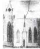
New Church in 1845 2