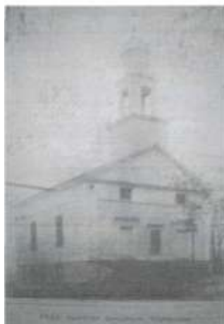
Free Will Church on Winter St.