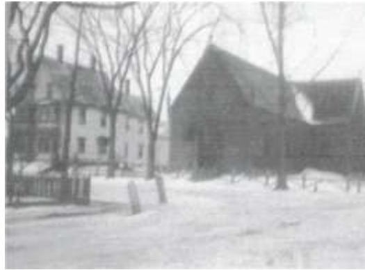
Early picture of St. Paul's Church