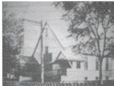
Church in 1909