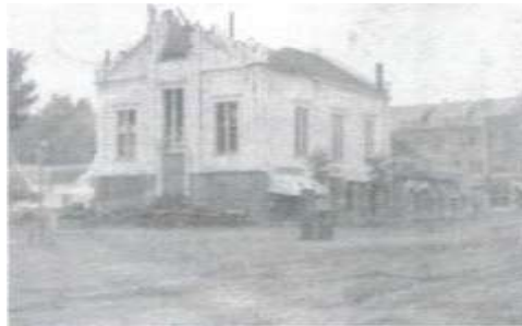
Universalist Church Fire

We step into a store and cry out excitedly to the men inside that there is a big fire downstreet. One of them, lolling against a cracker barrel, waves a hand and says there isn't—"It's over in Topsham." "Step outside, then, and see for yourself," we exclaim impatiently. He steps out, just in time to see the great spire, its skeleton glowing in outline, topple slowly over into the street. When we get to the fire, we find the Topsham fire company there, as well as the local companies; and the men are manning the brakes furiously. They tell us that they had been unable to save the spire, because the water turned to spray before it reached it and therefore was ineffective. But the rain helps some, and finally the blaze in the rest of the building is fought to a smolder.