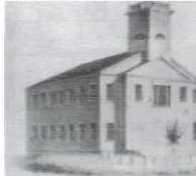
Second Church 1808-1845

1866 a new meeting house was built on "the hill" in town and the old one abandoned. A new meeting house was built in 1808 with subscriptions—a large amount of which came from Bowdoin College. In 1845 another new meeting house was built.