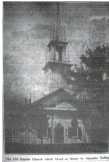
The Maine Street Church