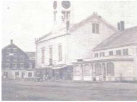
Universalist Church 1880

We pass under the arcade fronting of the various stores which are on the first floor of the church building; turn down Mason Street, and begin to go up the long flight of stone steps, this time only a short flight, into the body of the building. At right and left of this entry other flights of stairs go up to the gallery. Rubbing elbows with others who are entering the auditorium we come into the large square room in which we gather for worship. We look behind us as we enter and notice the big queer-looking stoves, one on either side of the rear entrance of the auditorium, setting back in the shallow alcoves. In the winter we stand around them till we get our feet warmed, but there is no need of that today.