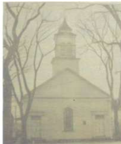
Elm Street Church