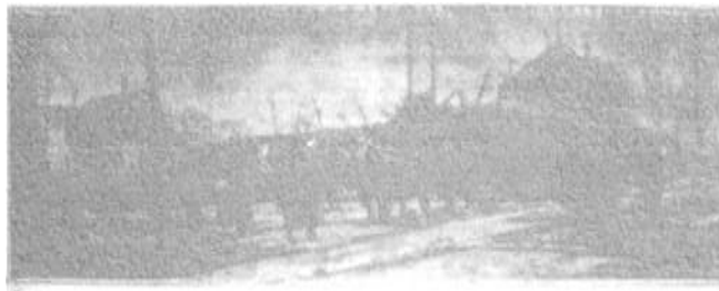
Ruins of Catholic Church after the fire